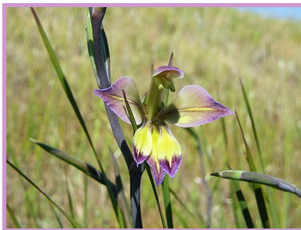
Gladiolus orchidiflorus