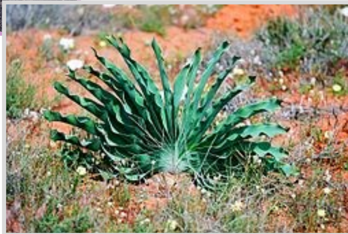
Boophane haematoides